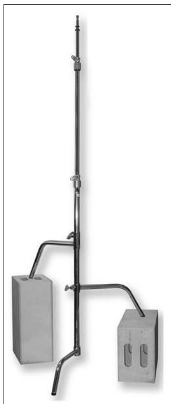
754042 40" C-Stand with Double Sliding Leg Weight: 12 lbs. (5.5Kg) List Price: $198.00