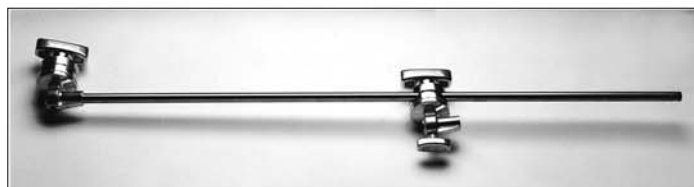
655040 40" Grip Head & Stainless Steel Arm Weight: 4.5 lbs. (2Kg) List Price: $75.00 Available in black finish. B655040