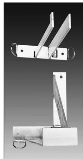
429658 Century Stand Door Rack Holds up to six stands securely. Weight: 4 lbs. (1.8Kg) List Price: $165.00