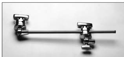
655020 20" Grip Head & Stainless Steel Arm Weight: 3.25 lbs. (1.5 Kg) List Price: $75.00 Available in black finish. B655020