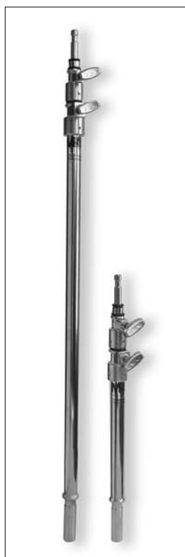
339761 C+20" Riser Section Only Weight: 7 lbs. (3.2Kg) List Price: $83.00