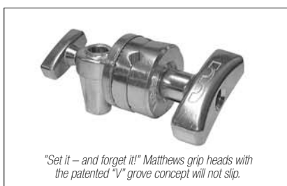
350580 Hollywood Grip Head™ The strongest and most popular grip head in the industry. Plates feature 3/8" and 5/8" mounting holes. Weight: 1.3 lbs. (0.6Kg) List Price: $39.00 Available in black finish. B350580