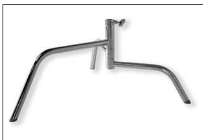
755001 Hollywood Century Turtle Base Only Weight: 5 lbs. (2Kg) List Price: $110.00