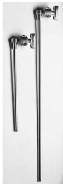
681012 20" Stainless Steel Arm Weight: 2 lbs. (1Kg) List Price: $51.00