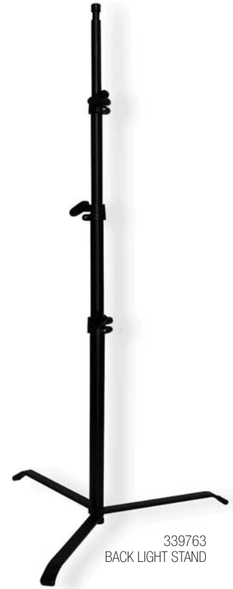
339763 BACK LIGHT STAND

B387487 Kit — Light/Heavy Double Riser — Black Maximum Height..... 100.5" (2553mm) Minimum Height.....39" (991mm) Weight Capacity.....25lbs (11kg) Weight.....6lbs (3kg) Footprint.....43" (1090mm) Folded Base.....5" (127mm) List Price: $160.00