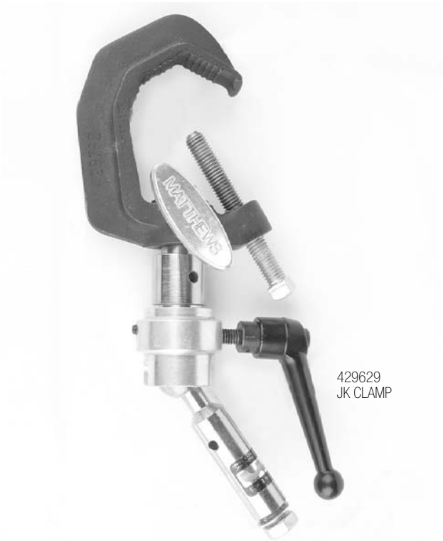
429629 JK CLAMP