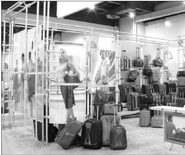
Pacific Coast Luggage